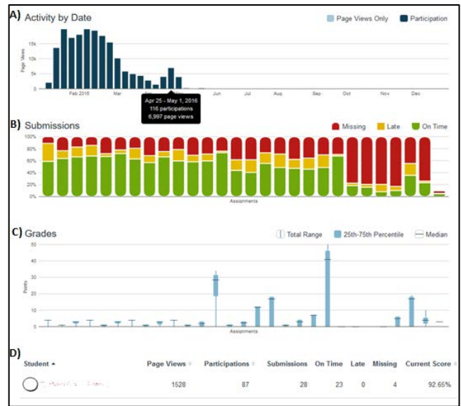
Figure 1. Canvas Course Analytics overview dashboard with insets: A) Activity by Time, B) Submissions, C) Grades, and D) Individual student activities data table [11].

The "Grades" visualization uses bar and whisker charts to represent grade distribution for assignments (homework assignments, quizzes and exams) using their point values rather than percentiles; submissions are displayed in order of their due dates. The visualization allows comparison of assignment grade distributions and displays a median point values for a submission; however, a percentile scaling may be of more utility.