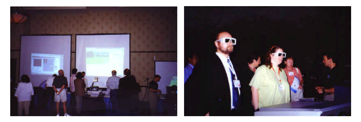
Figure 3: Interactive demo's on large screens. Many participants tasted VRCO's threedimensional virtual reality system - VGeo for the first time.

Two interactive demonstration sessions included a demo of VRCO's VGeo system and demos from many WS attendees. An expert panel discussed the future of research and development and started formulating top-ten research challenges for visual interfaces to digital libraries to help focus and guide research. In his concluding remark, Chaomei Chen outlined promising areas for future information visualization research, namely, Visual Information Retrieval, Visual Information Exploration, Visual Information Organization, Accommodating Individual Differences, Supporting Collaborative Work, Information Visualization for Bibliometrics, Information Visualization for Scientometrics, Knowledge Tracking, Knowledge Discovery, Designing and Deploying Tangible and Meaningful Visual-Spatial Metaphors in Digital Libraries.