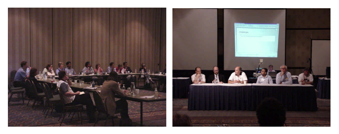
Figure 4: A lively discussion between the audience and the expert panel.