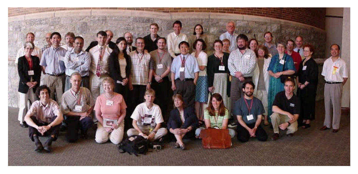
Figure 2: Participants of the workshop.

The first international workshop on "Visual Interfaces to Digital Libraries" was held at the first ACM+IEEE Joint Conference on Digital Libraries in Roanoke, VA, USA on June 28th 2001. The one-day workshop draw an international audience of 37 researchers, practitioners, and graduate students from a range of disciplines, including information visualization, digital libraries, human-computer interaction, library and information science, computer science, and geography.