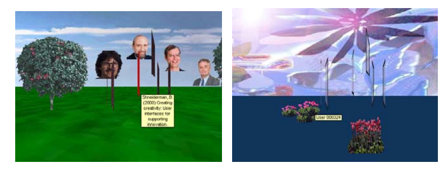
Fig. 2. Design sketches of Document Space (left) and User Interaction Visualization Space (right)

You may also want to find users that are interested in similar topics. You teleport into the User Interaction Visualization Space (see scenario #2) to find chat or document access activity that matches certain topics.