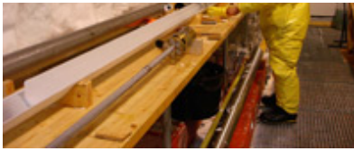
Pushing an ice core out of the drill.