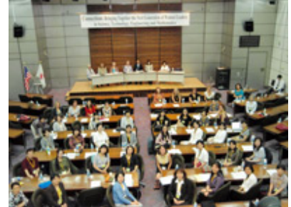
U.S. and Japanese scientists and engineers participate in the Connections workshop.

Last month, more than 40 early- to mid-career women scientists and engineers gathered in Saitama, Japan, to participate in an NSF-sponsored workshop designed to help establish international research collaborations. The "Connections" workshop, which brought together U.S. scientists with their counterparts from Japan, aimed to prepare the participating women for leadership positions in their fields by expanding their professional networks while also fostering the personal and professional connections that drive research collaborations.