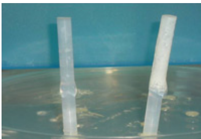
Test rod with new anti-biofilm surface treatment (left) compared to untreated control rod (right). The untreated rod exhibits unwanted biofilm coating (white material).

Semprus Biosciences has developed an anti-microbial and anti-thrombotic surface for medical devices that significantly reduces the growth of biofilm, the leading cause of medical infections. This new material, developed with funding from NSF's Small Business Innovation Research (SBIR) program, virtually eliminates incidences of blood clot formation.